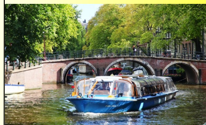
Amsterdams Canals by boat: www.lovers.nl