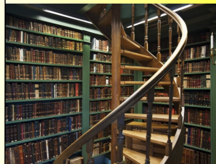
World's oldest Jewish library: www.etschaimmanuscripts.nl

Places of interest within walking distance