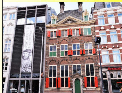
The Rembrandt house: www.rembrandthuis.nl