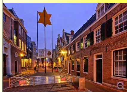
Jewish Historical Museum: www.jhm.nl